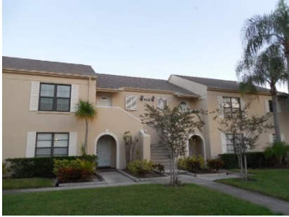
Roof & Elevation